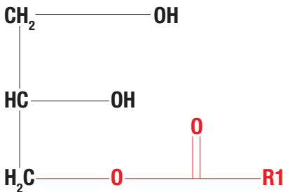
Figure 1. Monoglyceride Chemical Representation in MaxSimil Fish Oils (R1 = fatty acid)

Unique structure: One fatty acid attached to a glycerol backbone provides two polar ends that attract water and a non-polar tail end (R1) that attracts fat, thus enabling self-emulsification of the MonOmega DS formulas.